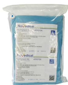
Nulplant Kit Plus